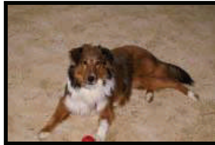
Gracie (aka Devil Dog)