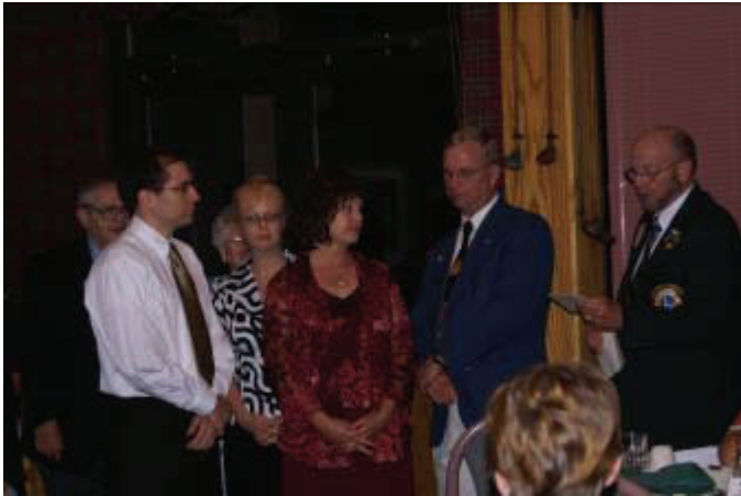
Our New Officers