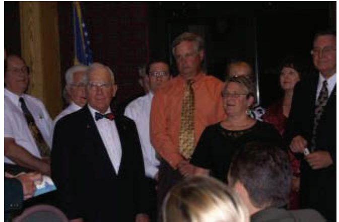
Our New Officers