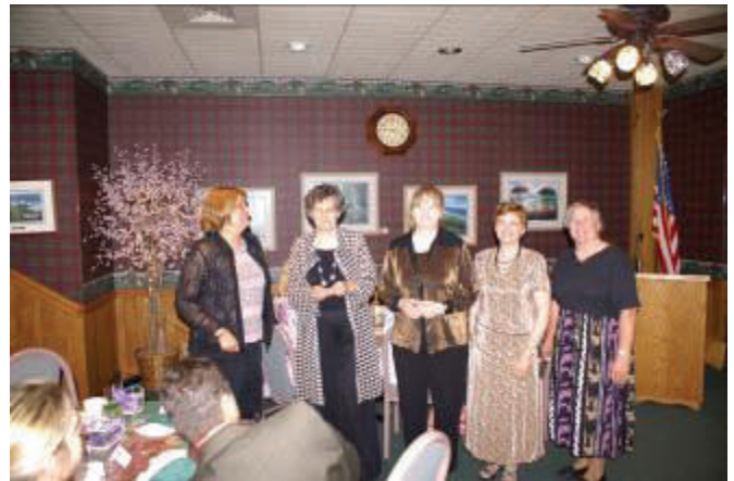
Our Newest Lions (Welcome)