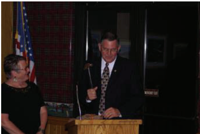
When a Lion Bangs the Gavel We Mean Business