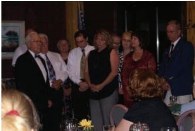
A Motley Crew