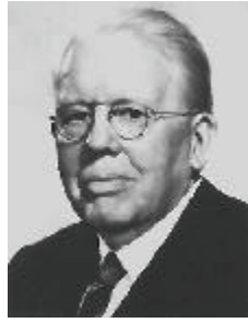
Melvin Jones (The Founder of the Lions)