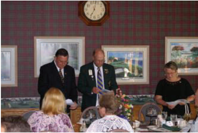
Practice Makes Perfect